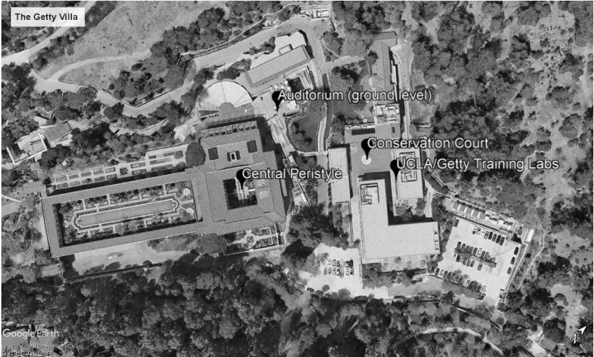
The J. Paul Getty Museum, Getty Villa, 17985 Pacific Coast Hwy, Pacific Palisades, CA 90272